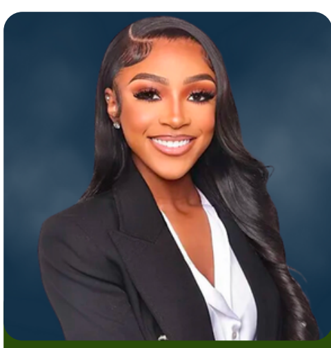
National Director of Corporate Engagement