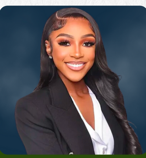
National Director of Corporate Engagement